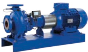
Etanorm with PumpMeter and IE3-motor